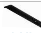
Pro Pull Bar

Perfect for smoothing raw, sharp edges on freshly cut tiles.