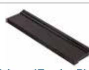
Universal Tapping Block

Use to gently pull together planks of tongue-and-groove, laminate or wood flooring