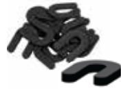
1/4" Horseshoe Shims 75 Shims