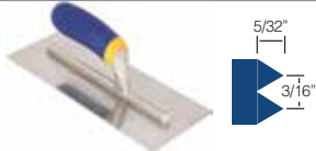
3/16" x 5/32" V-Notch Trowel