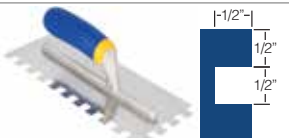
1/2" x 1/2" x 1/2" Square Trowel