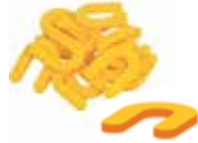
3/16" Horseshoe Shims 100 Shims