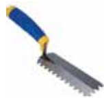
6" x 2" Margin Trowel