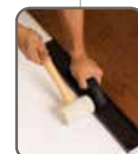
Plank Tapping Block

Rubber mallet head with fiberglass handle designed for tile