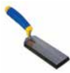
6" Margin Float