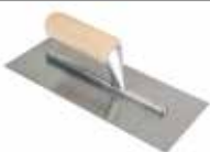
Patch and Finishing Trowel