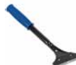
4" Razor Scraper