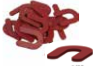
1/8" Horseshoe Shims 150 Shims