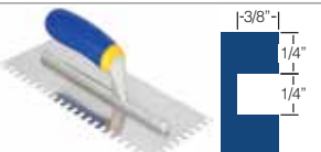
1/4" x 3/8" x 1/4" Square Trowel