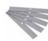
4" Razor Scraper Replacements