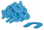
1/16" Horseshoe Shims 200 Shims