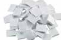
1/8" Wedge Tile Spacers 500 spacers