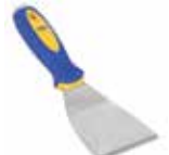
3" Chisel Scraper