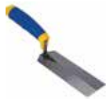
6" x 2" Margin Trowel