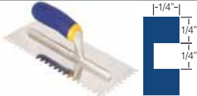
1/4" x 1/4" x 1/4" Square Trowel